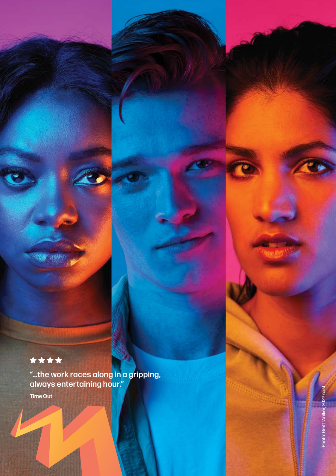
coast