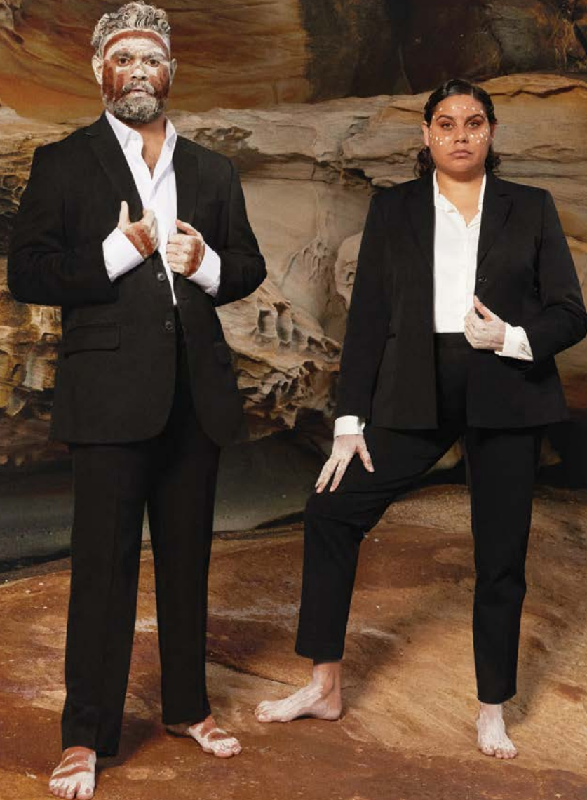
Featuring 2023 cast